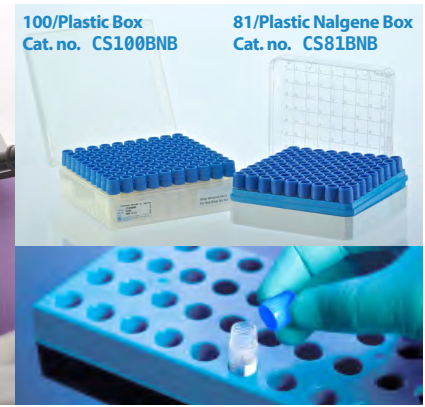
100/Plastic Box Cat. no. CS100BNB 81/Plastic Nalgene Box Cat. no. CS81BNB Workstation, securely holds 40 vials, Cat. no. 802501