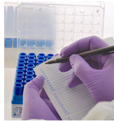
Box contains moisture-proof log card