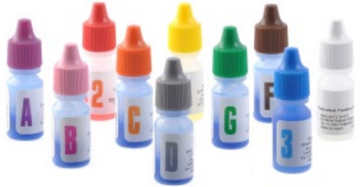
StrepPRO Grouping Reagents