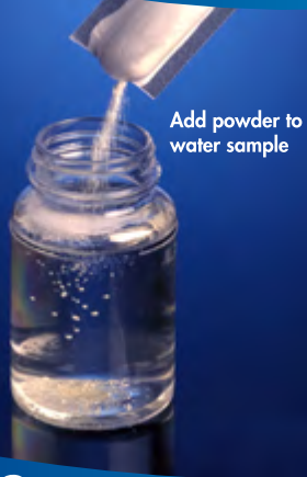
Add powder to water sample