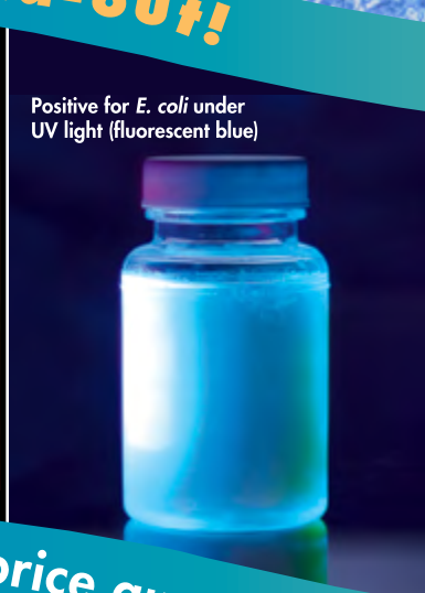
Positive for E. coli under UV light (fluorescent blue)