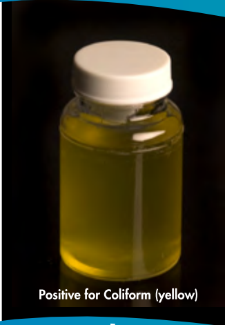
Positive for Coliform (yellow)